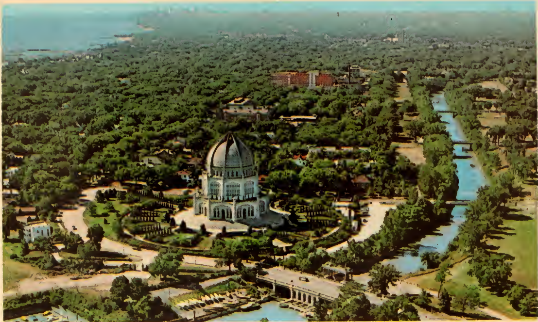
Bahá'í House of Worship